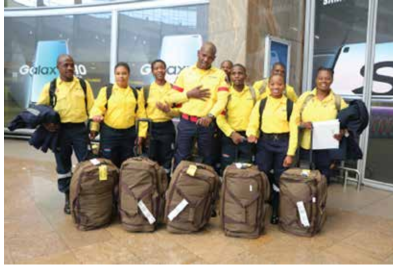
Some of the WoF firefighters that arrived early from Canada.

The deployment of the WoF firefighters in Canada further deepens the relations between