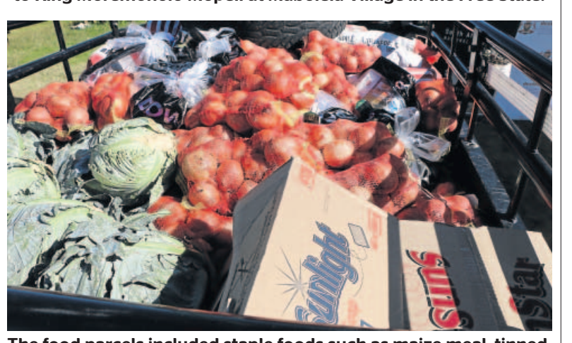
The food parcels included staple foods such as maize meal, tinned products, vegetables as well as soap, hand sanitiser and masks.