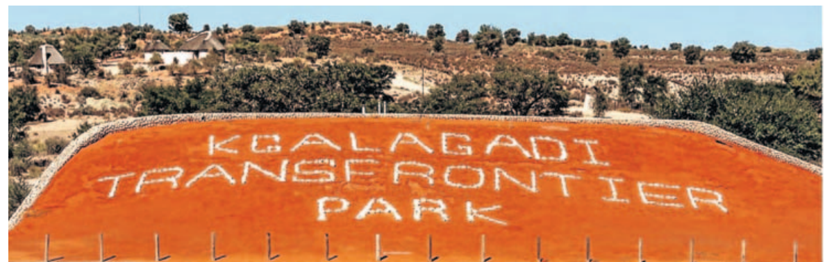
The Kgalagadi Transfrontier Park spans 35,551km.