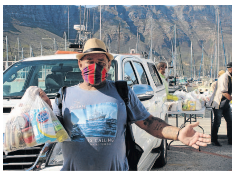
A delighted fisherman shows his thanks for the donation.

Consequently, some sections of the fishing industry have felt the impact of the coronavirus longer than other sectors of the economy.