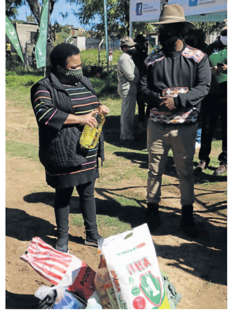
Environment department's deputy minister Makhotso Sotyu chats to King Moremoholo Mopeli at Mabolela Village in the Free State.

Speaking to the local chiefs and mayors of the communities they visited, the deputy minister said that this initiative was funded by the SANParks Honorary Rangers and the United Nations Development Programme.