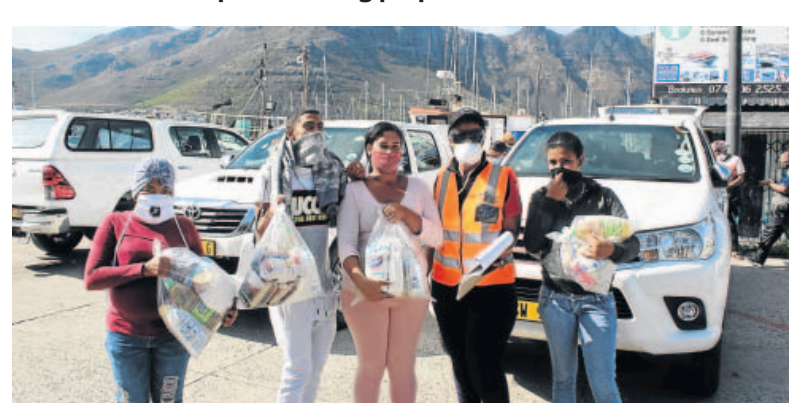
Fishermen and women receive their food parcels in Hout Bay.