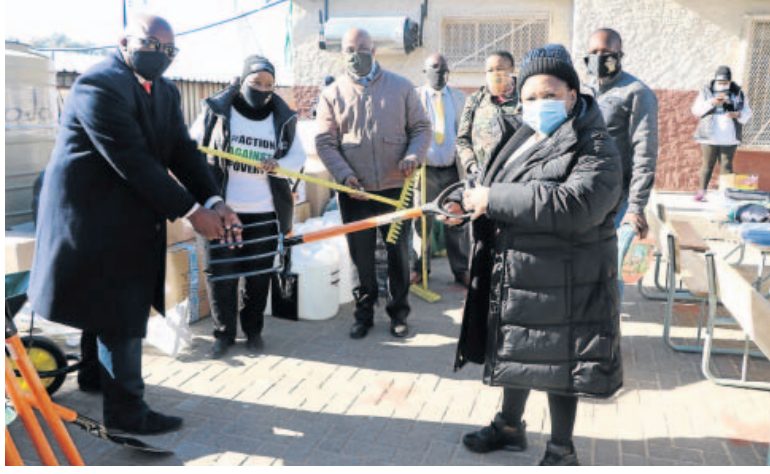
The Ladybrand Public Primary School welcomes garden tools donated by the environment department.

This year's Mandela Day comes as communities and economies across the world are hit by Covid-19, causing new