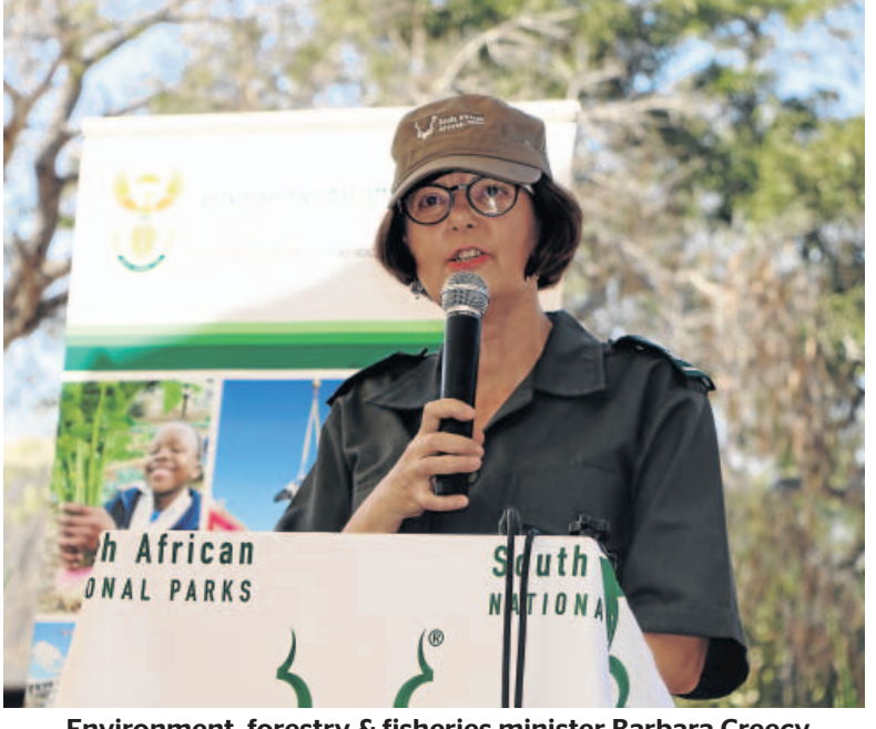
Environment, forestry & fisheries minister Barbara Creecy addresses the World Ranger Day celebrations.

have had to face not only the threats posed by poachers, but they, and their families, have also had to deal with the danger of contracting Covid-19."