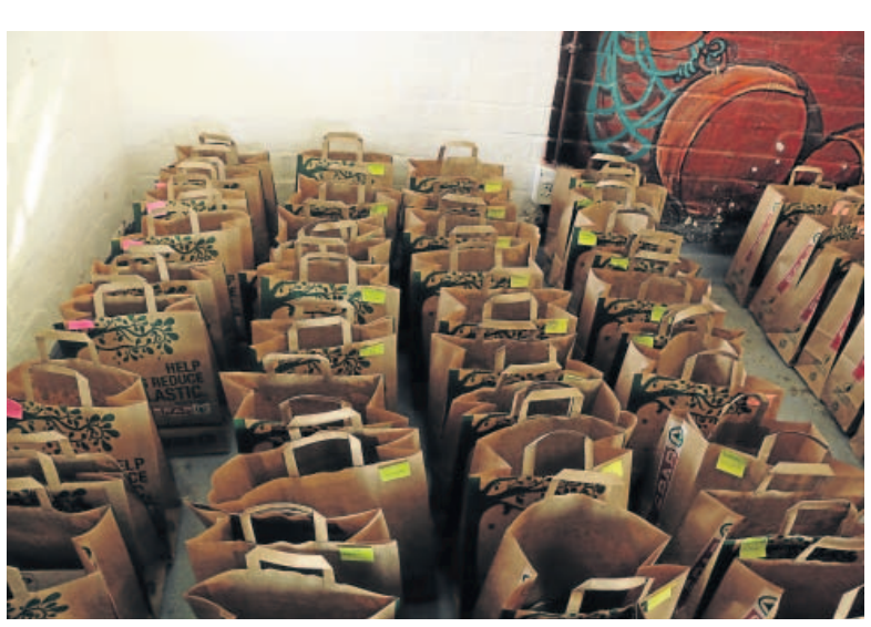
Kogelberg fishing community members received 94 parcels and food vouchers to help them survive during lockdown.