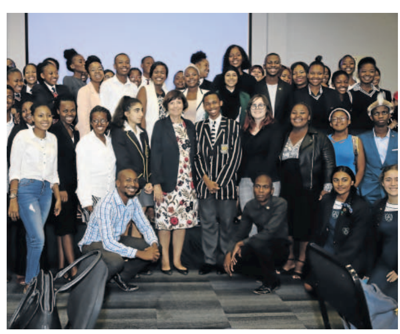
Environment, forestry & fisheries minister Barbara Creecy engages with a group of young South Africans and encourages them to actively participate in green initiatives.