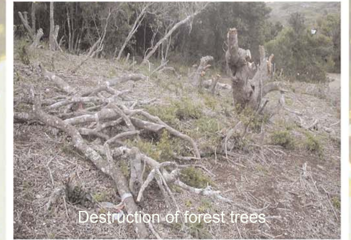
Destruction of forest trees